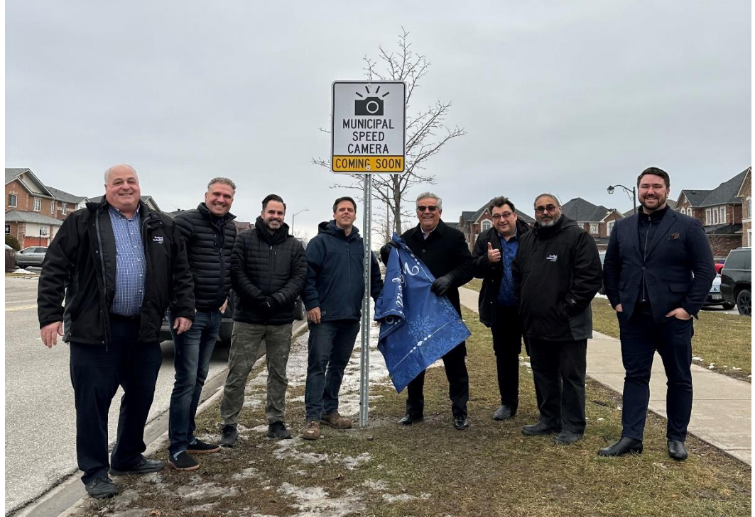
16 Council at the ASE pilot project unveiling.