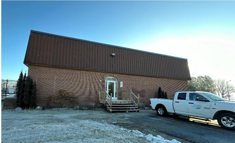
22 Exterior of Lions Park building

The Lions Park building was originally built in 1976, along with the former outdoor pool. Over nearly 50 years, the building has served our community as a meeting place, the original home of BWG's Recreational team, and pool change room. Since the closure of the outdoor pool in 2012, the building has been used exclusively to host some of the Town's summer camp programs.