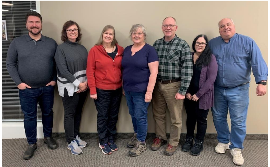
19 Members of the Heritage Advisory Committee

The evaluation is complete and the sub-committees have developed a shortlist of 95 priority properties, which received scores of nine or above during the evaluation.