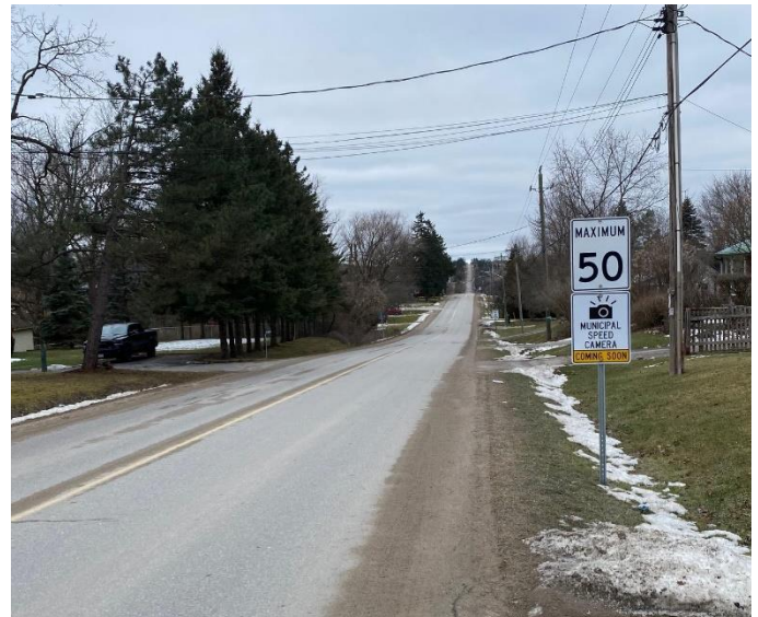
14 ASE Advanced Warning Signs at Line 7

The Automated Speed Endorsement (ASE) pilot project is another community safety initiative welcomed by Ward 3 residents. One of the four first speed camera locations announced earlier this month is in Ward 3, on Line 7, between Lallien Drive and Dixon Road. A big thank you to our Community and Traffic Safety Committee and staff who found a full turn-key solution with no upfront costs.