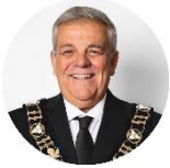
3: Mayor James Leduc

Bradford West Gwillimbury Council consists of nine members, all of whom are elected by the public. The Mayor and Deputy Mayor serve the residents at large, and the seven Councillors each represent a Ward within the municipality.