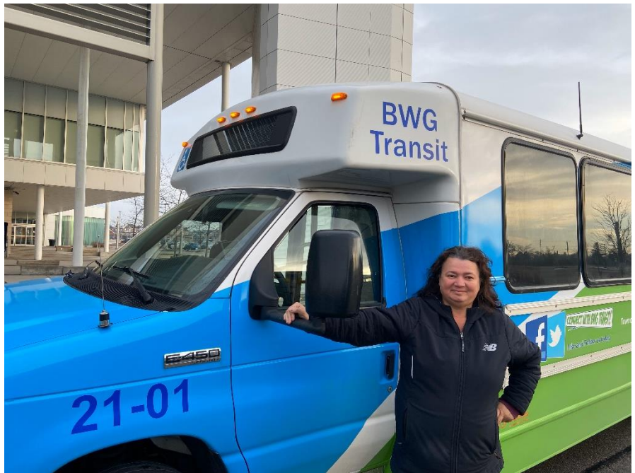
24 BWG Transit Driver

The Town constantly hears positive feedback and stories about the difference our transit team makes in the community. From helping reunite a customer with a lost item to educating newcomers on local transit routes, local transit helps connect hundreds of customers with the people they love, to the places they need to be, and to the services they depend on daily.