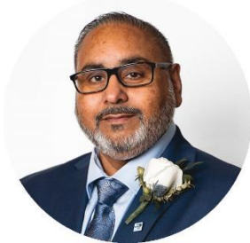
3: Photo of Deputy Mayor Raj Sandhu

We are proud to welcome you to our second edition of Connected — BWG's latest interactive and digital publication. In order to maintain its interactive elements, like photo slideshows, video integration, and links to our website, this publication is best viewed online. You can however download and print the pdf using the "Download PDF" icon on the ribbon at the bottom of this page.