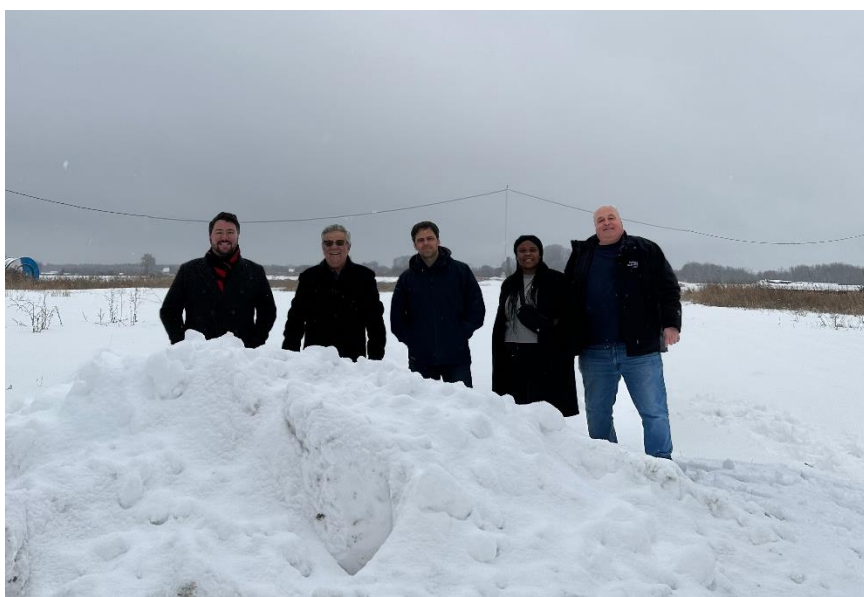
21 Council members at the future Snow Disposal Facility site at 225 Dissette Street.

“We have an important role on Council to be community and environmental stewards. These projects play a significant role in improving our local environment and build on our ongoing commitment to operate a safe, healthy, and sustainable BWG for all.” — Mayor James Leduc